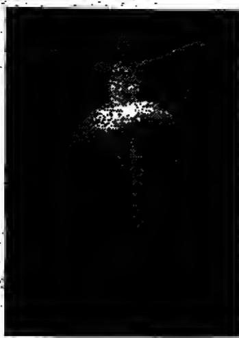
Orna Kugel stars in the Israel Ballet's 30th-anniversary performance of 'Carte de Visite.'